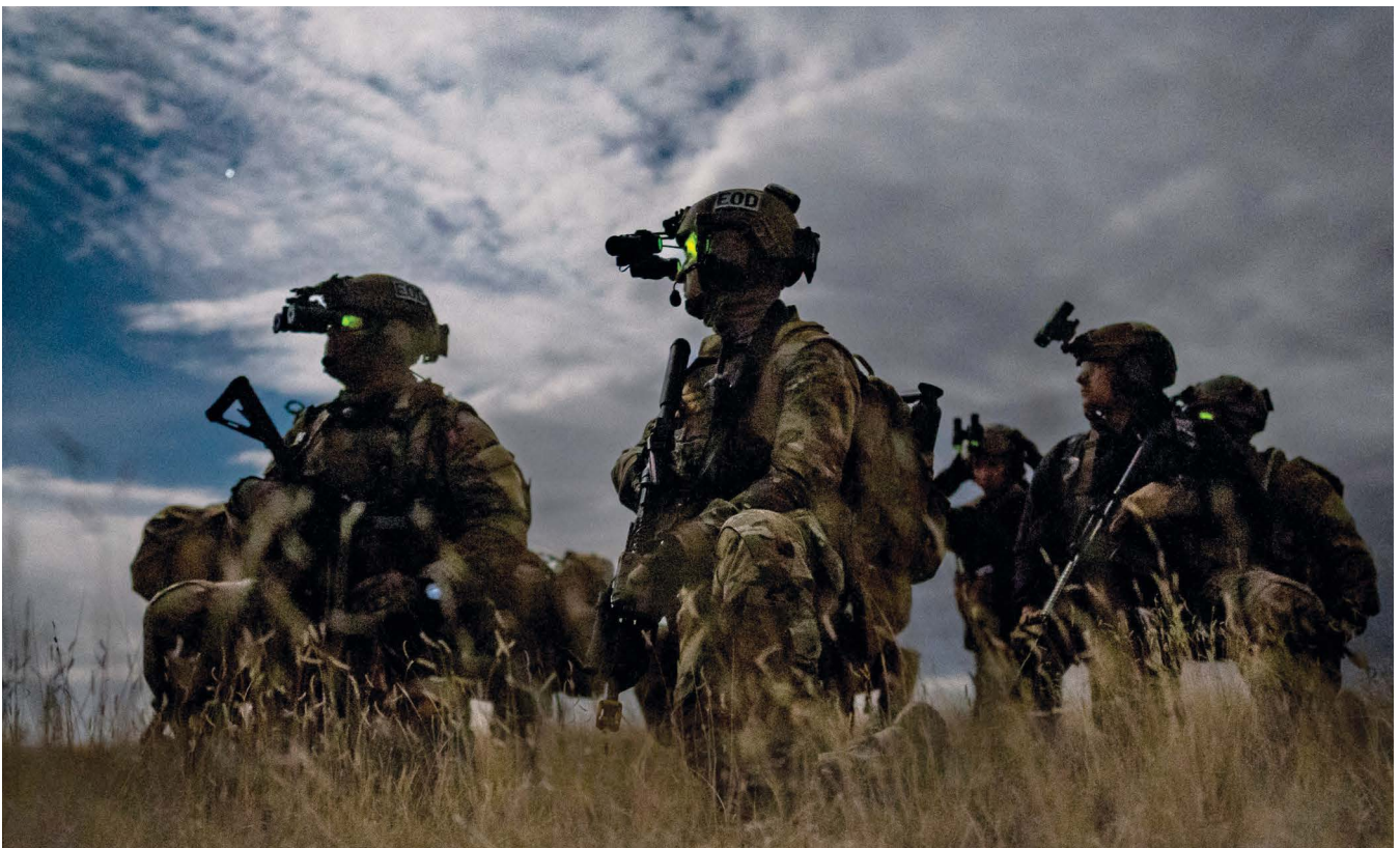
2d Lt. Merit Davey

Source: U.S. Air Force Total Aircraft Inventory (TAI) as of Sept. 30, 2023