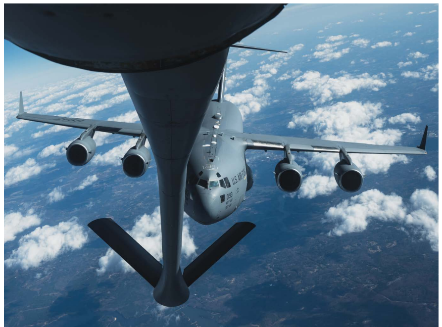
A C-17 from the 15th Airlift Squadron, Joint Base Charleston, S.C., approaches a 63rd Air Refueling Squadron KC-135 from MacDill Air Force Base, Fla., on Nov. 28, 2023.