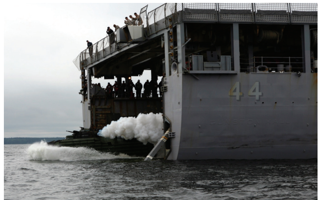
U.S. Marines amphibious assault vehicles embarked aboard the USS Gunston Hall (LSD 44) depart the well deck during the start of a simulated amphibious assault. The combined U.S., Estonian amphibious landing was part of a demonstration of the interoperability between the two forces.

As part of BALTIC OPERATIONS 10, U.S. Marine and U.S. Navy forces, along with our Baltic State allies, conducted both a Maritime-Prepositioning Force offload and onward movement of combat equipment in Ventspils, Latvia, and a combined amphibious landing in Estonia during this European Command-sponsored Partnership for Peace Exercise. The overwhelmingly positive response