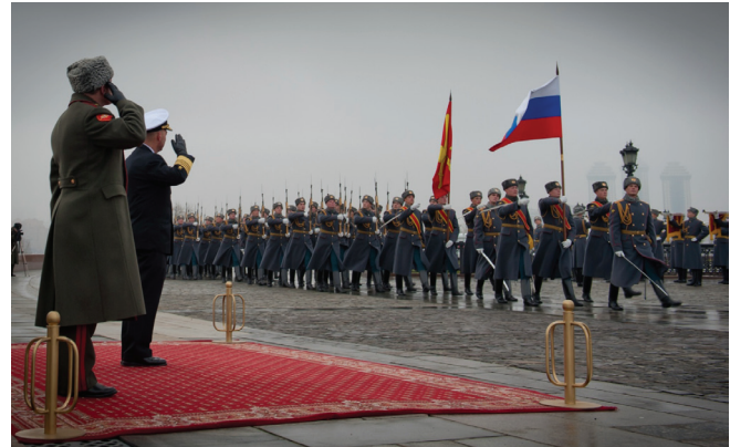
Admiral James Stavridis, SACEUR, during an Honor Guard Ceremony in Moscow, Russia.

Continued open dialogue can lead to additional opportunities for cooperation and openness, such as European Command's response to assist Russia during last year's wildfires. On the