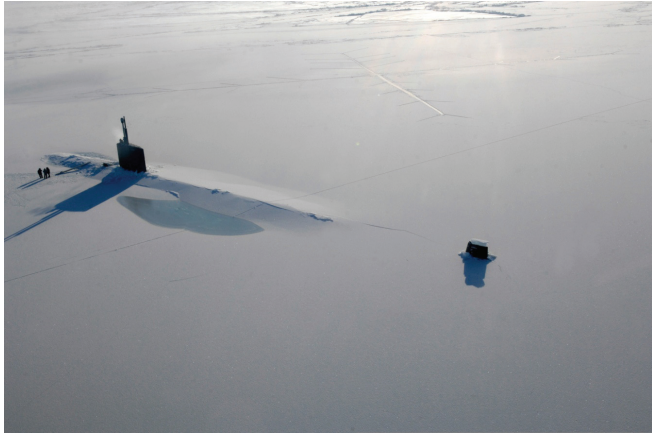
U.S. Submarine surfacing in the Arctic

also to the safety of the mariners, workers, and tourists who will populate this vast expanse.