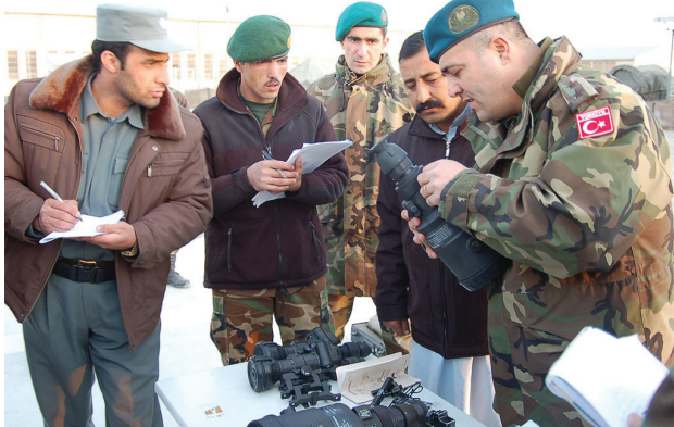
Afghan National Police and Afghan National Army personnel receive technical training on night vision goggles and thermal cameras by a Turkish officer

The situation in Afghanistan today is complicated and deeply challenging, as external