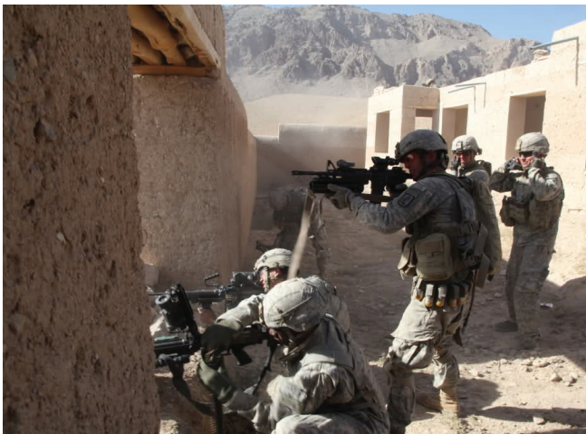
U.S. Army Soldiers from the 173rd Airborne Brigade Combat Team get ready to engage enemy combatants

equipment through Europe to Afghanistan over the Northern Distribution Network. In FY10, we coordinated use of the Department of Defense Lift and Sustain Program to provide non-reimbursable air and sealift to move 14,897 passengers and 4,206 tons of cargo for 13 contributing nations, who would have otherwise been unable to move equipment