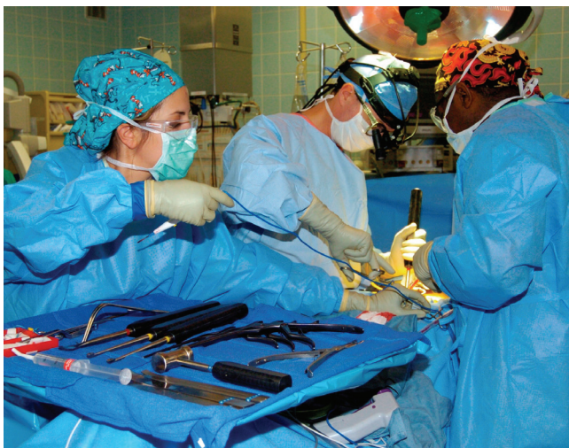
A surgical team from Landstuhl Regional Medical Center, Germany, operates on a Soldier injured in combat operations

Theater Infrastructure. Thanks to strong and continued Congressional support, previous annual military construction authorizations and appropriations have enabled European Command to address a balanced mix of our most pressing mission, mission support, quality of life, and housing requirements. The goal of our fiscal year 2012 military construction program is to support ongoing force posture initiatives, consolidation efforts, and infrastructure recapitalization projects including the Kaiserslautern Military Community (KMC) Medical