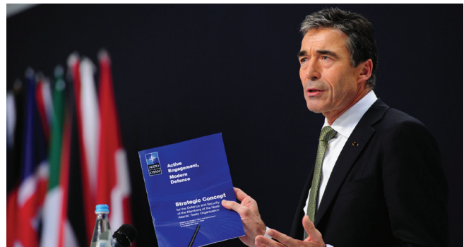
NATO Secretary General Anders Fogh Rasmussen unveiling the new Strategic Concept at the NATO Lisbon Summit

membership, because enlargement contributes to the goal of a Europe whole, free and at peace. The Strategic Concept also commits NATO to continuous reform towards a more effective, efficient, and flexible Alliance. The Strategic Concept reaffirms the fundamental purpose of