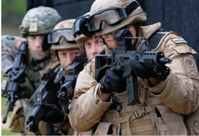
Croatian and Minnesota National Guard soldiers prepare to clear a room during an Operational Mentoring and Liaison Team training exercise at the Joint Multinational Readiness Center

Both on and off the continent, the Army in Europe planned for and exercised ground capabilities to support key NATO partners and Israel in defending against potential threats. It has worked with Israel to significantly improve their ballistic missile early warning capability and has enhanced bilateral air and missile defense training exercises in coordination with