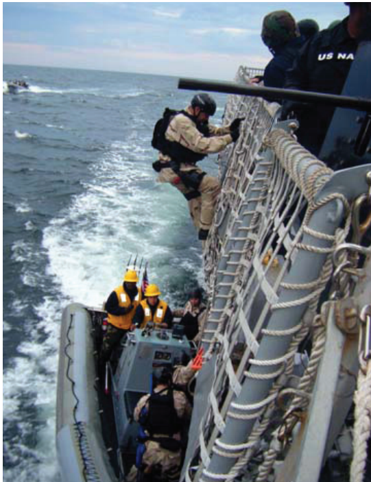
Members of the visit, board, search, and seizure team from the guided-missile destroyer USS Forrest Sherman (DDG 98) return to Forrest Sherman after participating in a boarding training exercise during BALTIC OPERATIONS

successfully fired three submarine-launched ballistic missiles over a period of two days. These operations reveal a renewed Russian focus on the undersea arena.