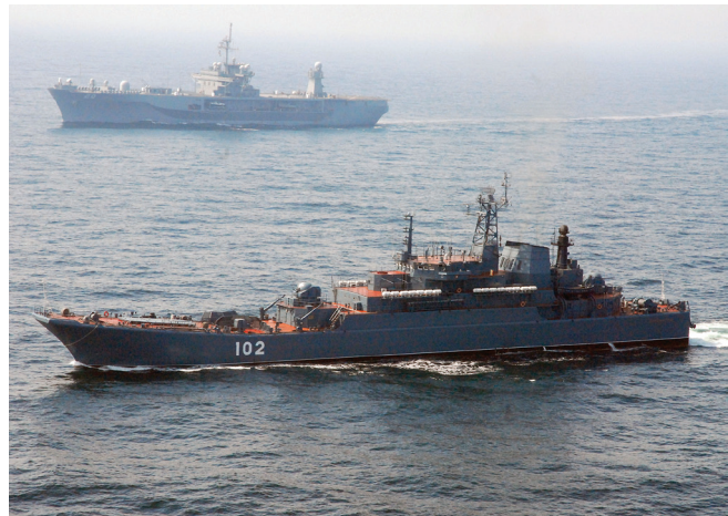
Russian amphibious ship, the RFS Kaliningrad, sailing alongside the USS Mount Whitney as parts of the BALTIC OPERATIONS exercises in the Baltic Sea

conducting counterterrorism and counter-piracy operations; peacekeeping missions; ballistic missile defense; and search and rescue. This framework document, signed by the Chairman of the Joint Chiefs of Staff and the Russian Chief of Defense at the 2009