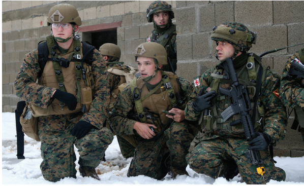
Georgian soldiers from the 31st Battalion establish security during a cordon and search scenario as they train for an upcoming deployment in support of International Security Assistance Forces in Afghanistan

will be able to operate independently. By using Georgian shadow instructors, Marine Forces Europe will create a Georgian training group that will largely take over the Partnership Training Program by their fourth rotation. Over this past year, this program trained two battalions that deployed to Afghanistan.