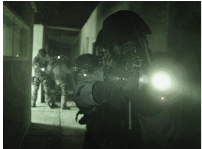
NATO SOF Forces conduct nighttime training

The NATO Special Operations Headquarters Communications Network underpins allied and partner SOF collaboration by providing an unprecedented vehicle for command, control, communications, and intelligence-sharing for networked operations. The Headquarters' Special Operations Forces Fusion Cell, in Kabul, Afghanistan, demonstrates this operational impact among allied and partner special operations forces. This stakeholder-run enterprise, manned by 40 personnel from 11 nations and several agencies, focuses on garnering information from a multitude of allied and partner sources, and fusing that information with operational