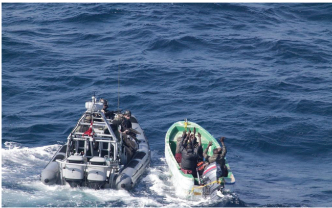
Danish warship, HDMS Esbern Snare, stops and boards a suspected pirate vessel in the Gulf of Aden as part of Operation OCEAN SHIELD

OCEAN SHIELD. Building on previous counter-piracy missions conducted by NATO beginning in 2008 to protect World Food Program deliveries, Operation OCEAN SHIELD is focusing on at-sea counter-piracy operations off the Horn of Africa. Approved in August 2009 by the North Atlantic Council, the current operation, working with almost 40 ships from allies and partners in the context of the Contact Group on Piracy off the Coast of Somalia, continues to contribute to international efforts to combat area piracy. This operation challenges normal