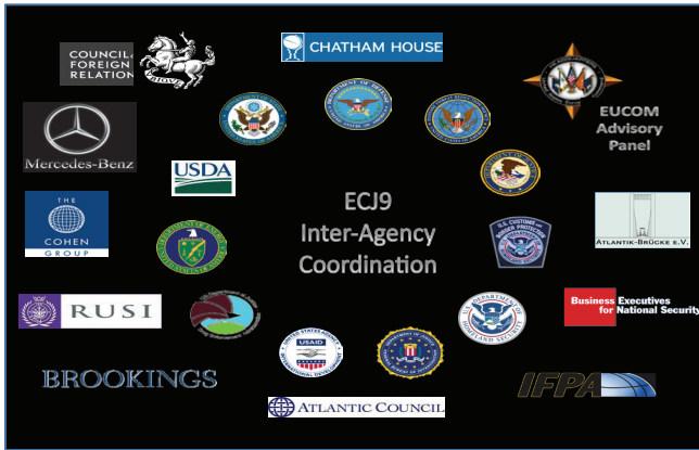
Interagency, academic, public, and private partners of the U.S. European Command

the private sector, think tanks, and military academic organizations. In the private sector, for example, we have gained many new insights by partnering with numerous organizations. As part of our efforts to engage leading European professionals, we have instituted the