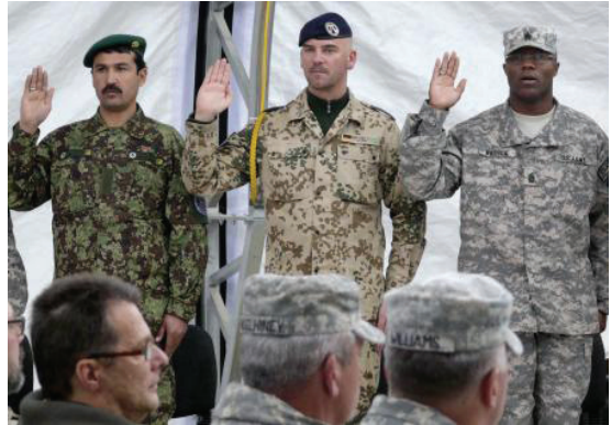
International Security Assistance Force non-commissioned officers (NCO) raise their right hands and repeat the charge of the NCO during an NCO induction ceremony in Afghanistan

In quantitative terms, since I last appeared before this committee, European Command has dispatched over 20 mobile planning teams and conducted three Observer Mentor Liaison Team rotations at the Joint Multinational Readiness Center, which included 16 countries and 1,045 personnel and conducted eight Expeditionary Intelligence Training courses in which we have trained 230 personnel from 14 countries. We have also trained over 1,860 soldiers from 15 countries to counter the threats posed by improvised explosive devices, and trained two Polish Brigades and two Georgian battalions for deployment to Afghanistan. On the logistics side, we have moved 487 tons of