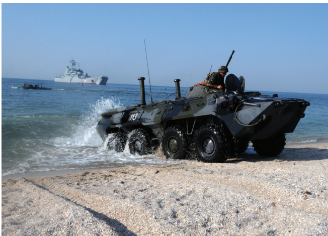
Ukrainian marine 1st and 2nd divisions stormed the beaches of Tenrda island from amphibious assault ships and helicopters to simulate landing on an island over run by pirates during a combined and joint maritime exercise in the Black Sea

Turkey. Turkey remains a strong ally and partner in the region and continues to grow in importance in the Middle East and Eurasia regions. Turkey will continue to play an important role in the fight against extremism, maintaining regional security and access, deterring common threats, and supporting NATO out-of-area operations, such as those in Afghanistan and Kosovo. As our presence in Iraq draws down, Turkey's concern with possible volatility on their border