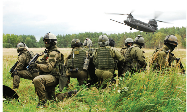
Coalition special forces wait for the MH-47G Chinook to land so they can extract their high value target during the opening ceremony for Jackal Stone 10

Exercises. Special Operations Command Europe supported the annual international theater-wide special operations forces capstone exercise, JACKAL STONE 10. This year's exercise was hosted by Poland and Lithuania and brought together approximately 1,100 special operations forces service members from seven nations: Poland, Lithuania, Ukraine, Latvia, Croatia, Romania, and the United States. As a key element of the Partnership Development Program, JACKAL STONE provides special operations forces the opportunity to train together and build mutual respect while sharing doctrinal concepts, training concepts, and various tactics, techniques, and procedures.