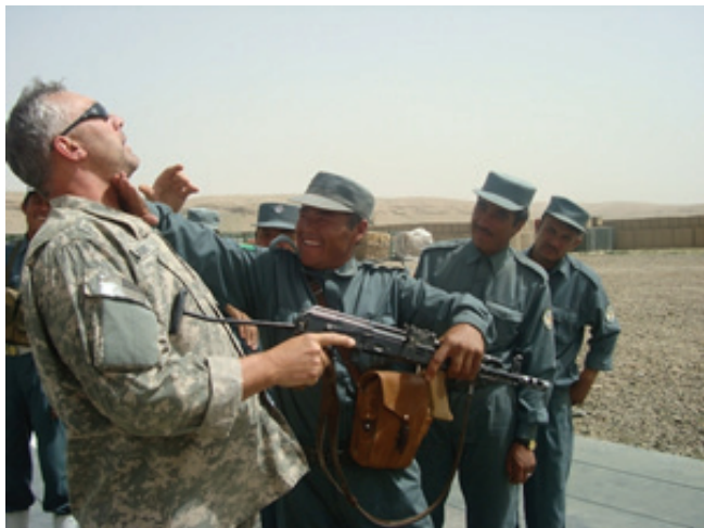
Combat training for Afghan National Security Forces

These requirements may include provision of equipment such as up-armored high mobility multipurpose wheeled vehicles (HMMWV) and mine-resistant ambush protected