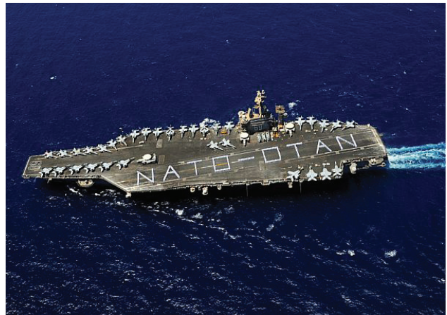
The USS Dwight D. Eisenhower Carrier Strike Group crew spells out NATO on the deck

Cooperative Security and Partnership. With respect to Cooperative Security and Partnership, NATO's new strategic concept recognizes that the Alliance is affected by, and can affect, political and security developments beyond its borders. This concept mandates NATO to engage actively to enhance international security: through partnership with relevant countries