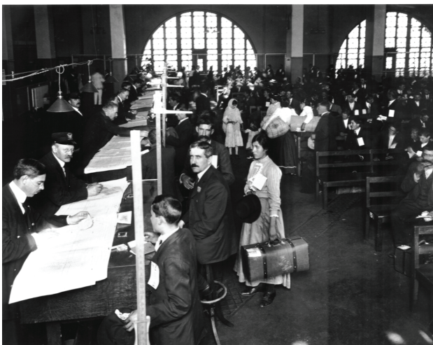
European immigrants entering the U.S. through Ellis Island

The most important ties for our command, of course, are those between our militaries. U.S. military traditions grew out of European ones. We have learned from each other, often in