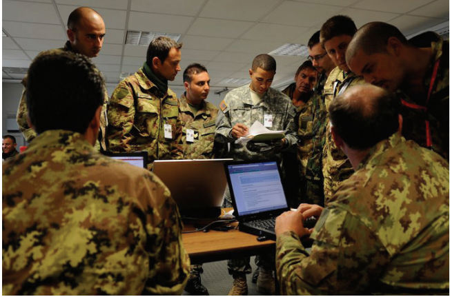
American and Italian technicians work to establish network connections during exercise Combined Endeavor 2010

This marked COMBINED ENDEAVOR's 16th year building partnerships and featured the participation of Iraq and Afghanistan as observer nations. Both nations committed to increased involvement and a dedication to interoperability between their national forces and NATO/Partnership for Peace nations.