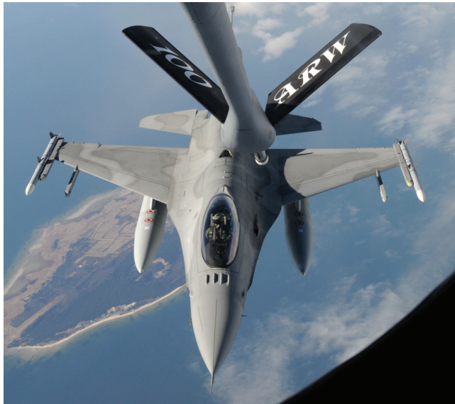
A Polish Air Force F-16 receives fuel from a US Air Force KC-135 over the skies of Latvia during a NATO Baltic Air Sovereignty Training event

Supporting contingency operations at the same rate as U.S.-based forces, Air Forces in Europe simultaneously conducted European Command operational requirements. In addition