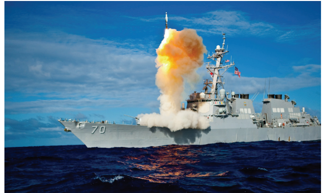
A Standard Missile - 3 (SM-3) is launched from the USS Hopper (DDG 70) in a Missile Defense Agency (MDA) test in conjunction with the U.S. Navy

As we work to provide defenses for our deployed forces, families, friends and allies, European Command continues the extensive and active cooperation necessary to implement the European Phased Adaptive Approach (EPAA) to Missile Defense. Together with our partners in the Department of State, Department of Defense, Missile Defense Agency, and many others we are fully supporting the coordinated international engagement of the United States.