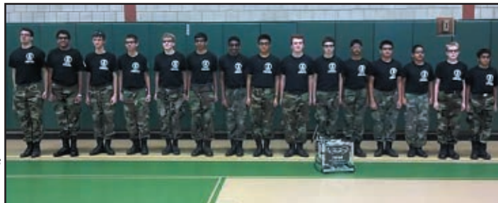
Civil Air Patrol Raritan Valley (N.J.) Composite Squadron cadets used an AFA/CAP grant to help them compete in a robotics tech challenge. That's their robot in front of them.