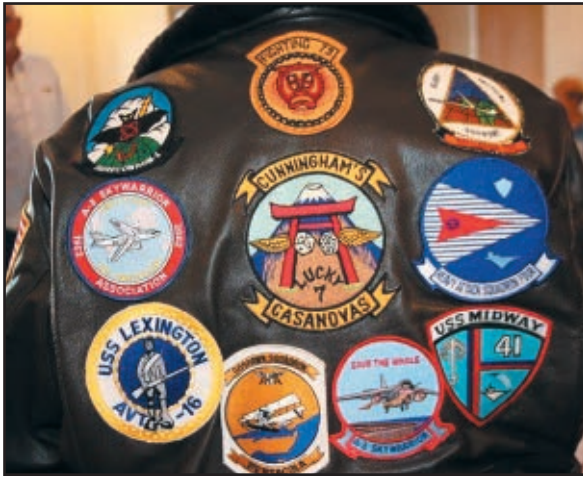
At the joint-services all-aviators gathering—co-hosted in Florida by the Hurlburt Chapter—many guests displayed their military résumé on their backs.