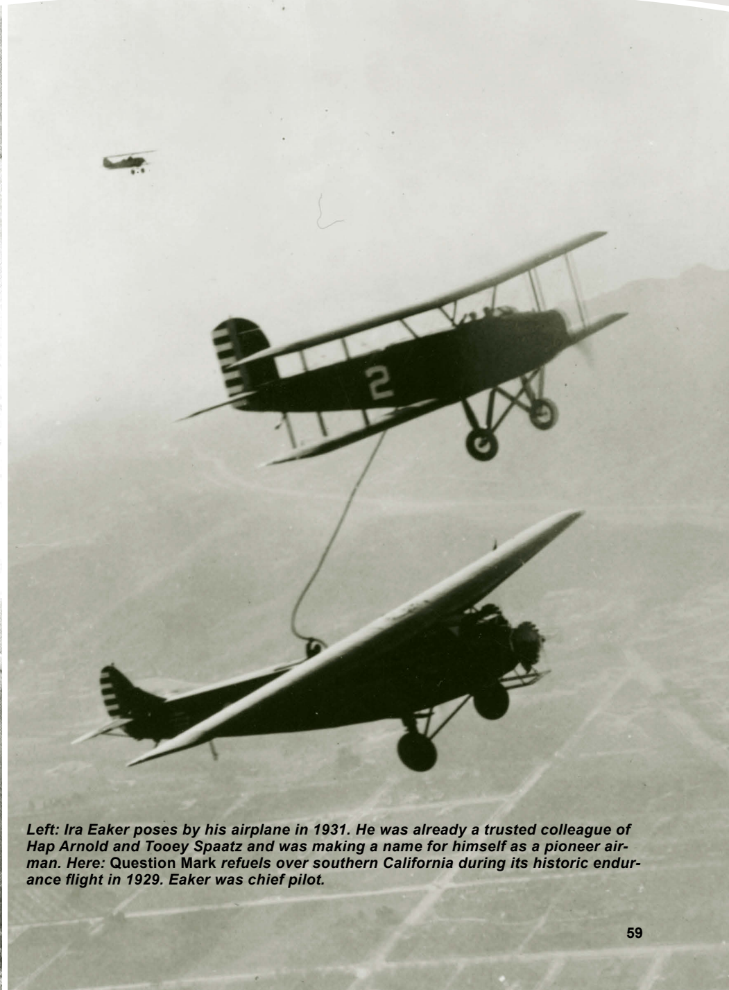
Left: Ira Eaker poses by his airplane in 1931. He was already a trusted colleague of Hap Arnold and Tooeey Spaatz and was making a name for himself as a pioneer airman. Here: Question Mark refuels over southern California during its historic endurance flight in 1929. Eaker was chief pilot.