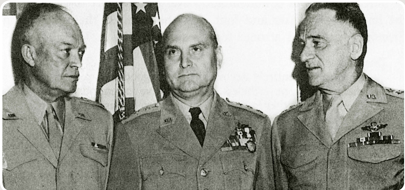
Gen. Dwight Eisenhower (l) presented Eaker (c) with an Oak Leaf cluster for his Distinguished Service Medal as Spaatz (r) looked on. Eaker retired shortly thereafter, in 1947.

ments were offset by losses in ensuing months, and there were seldom more than 200 B-17s flying out of England.