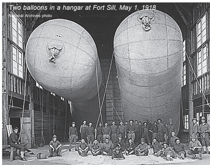
Two balloons in a hangar at Fort Sill, May 1, 1918