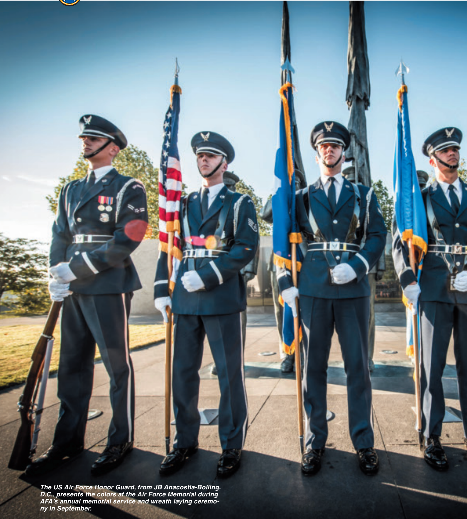
The US Air Force Honor Guard, from JB Anacostia-Bolling, D.C., presents the colors at the Air Force Memorial during AFA's annual memorial service and wreath laying ceremony in September.