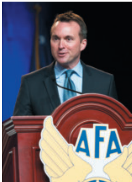
Acting Secretary of the Air Force Eric Fanning spoke about how Air Force heritage informs the present and future force.