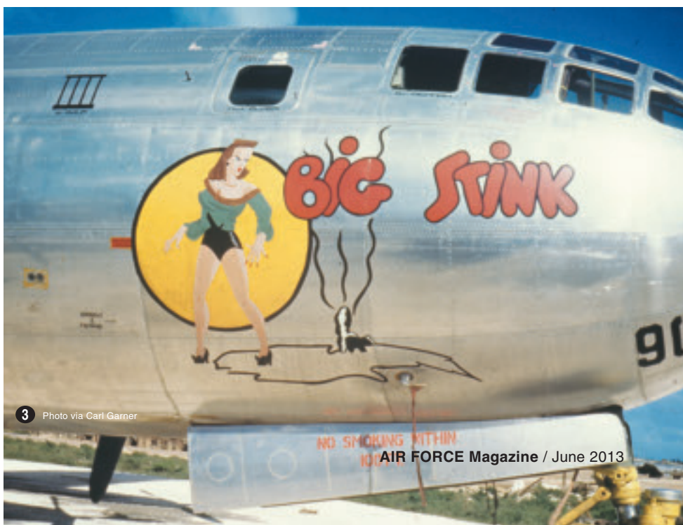
3

141 Maj. Gen. Curtis LeMay, 20th Air Force commander, standing in front of a B-29 on Saipan. LeMay, an aggressive advocate of bombers and the architect of the bombing campaign against Japan, went on to lead Strategic Air Command.