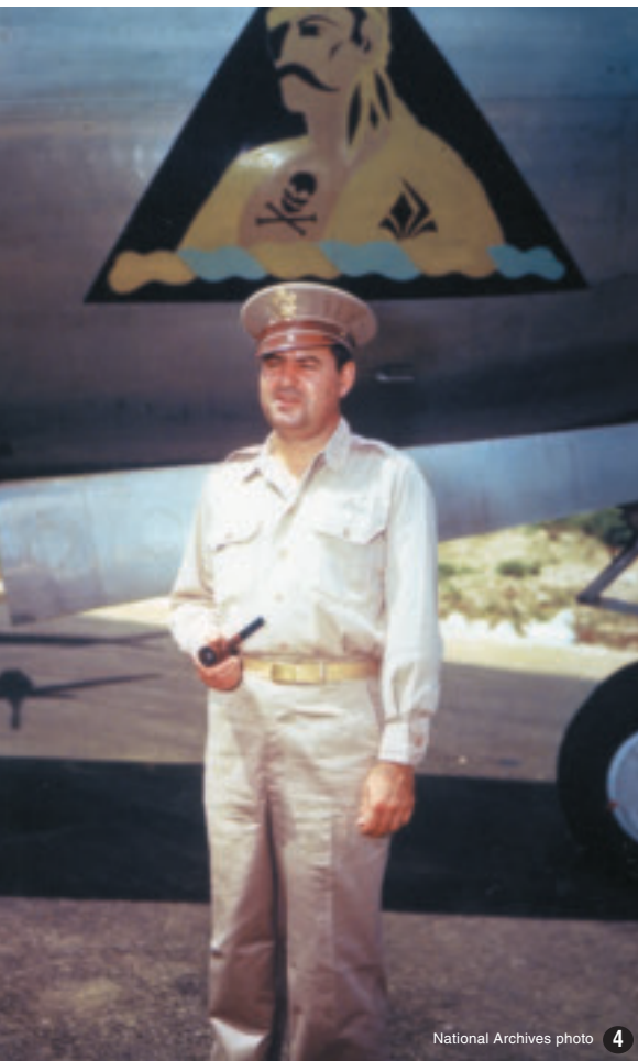
National Archives photo 4

141 Maj. Gen. Curtis LeMay, 20th Air Force commander, standing in front of a B-29 on Saipan. LeMay, an aggressive advocate of bombers and the architect of the bombing campaign against Japan, went on to lead Strategic Air Command.