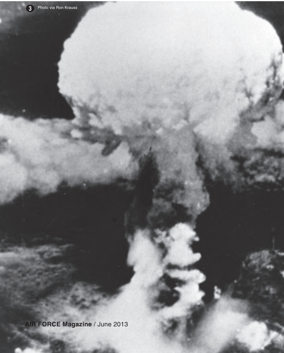
3

L ate in World War II, Col. Paul Tibbets Jr. took command of the 509th Composite Group to carry out a special, secret mission: attacking Japan with atomic bombs. The unit took shape at Wendover AAF, Utah, and then deployed to Tinian island in the Pacific. Practice and familiarization missions preceded the attacks on Hiroshima and Nagasaki. The “Silverplate” B-29s shown on these pages were among those that carried out or supported the missions. 11 The tail symbol of the 509th was an arrow inside a circle, but to hide the unit’s identity and confuse the Japanese, tail codes and symbols were regularly changed. The ground crew member here is repainting the vertical stabilizer symbol. 12 Bockscar, piloted by Maj. Charles Sweeney, dropped the second A-bomb on Aug. 9, 1945, on Nagasaki. The primary target was Kokura, but bad weather there shifted the mission to Nagasaki. Bockscar is on permanent display at the National Museum of the US Air Force in Ohio. 13 The image of the mushroom cloud over Nagasaki was taken from the tail gunner’s position as Bockscar made a high-speed dash to outrun the blast. The bomber was still caught by the shock wave.