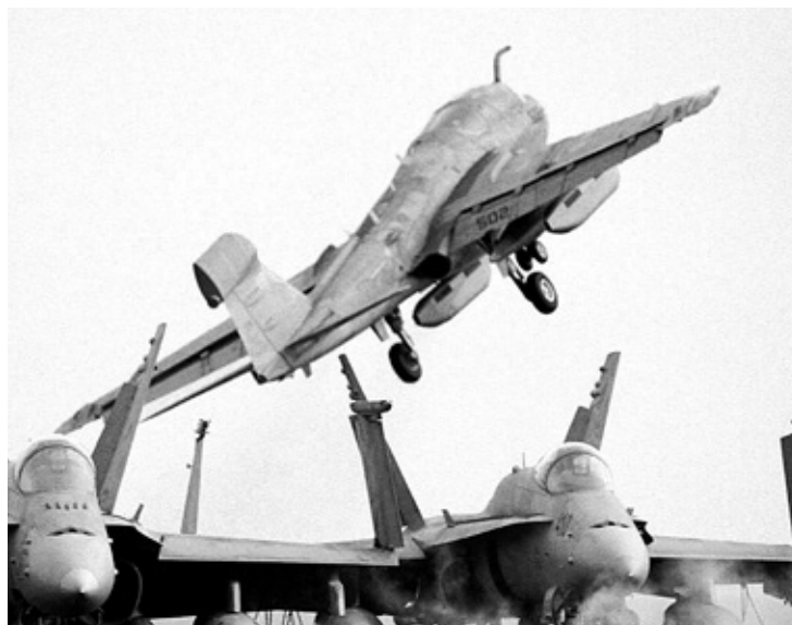
An EA-6B Prowler launches from the flight deck of USS Roosevelt.

Preceded by interim EA-6A "Electric Intruder," built in small numbers for USMC ★ features canopy embedded with gold, which blocks electromagnetic interference ★ suffered 55 losses in combat or training accidents ★ posted accident rate three times that of any other Navy or USMC aircraft in the 1980s ★ flies under stringent high-angle-of-attack restrictions ★ can sense location of buried improvised explosive devices and jam their detonation signals.