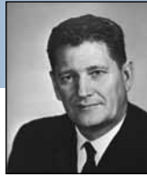
Joe Foss President, 1961-62 Chairman, 1962-63