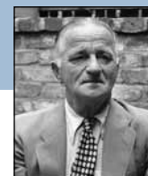
Carl A. Spaatz Chairman, 1950-51