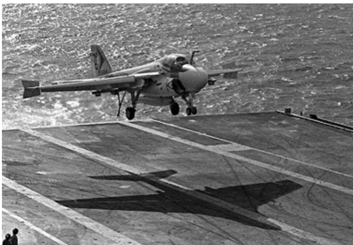
An Intruder comes in for a landing on the deck of USS Constellation.

Attracted design proposals from Bell, Boeing, Douglas, Grumman, Lockheed, Martin, North American, Vought ★ entered combat July 1, 1965, flying against Hanoi targets ★ nicknamed “Double Ugly,” “Iron Tadpole,” “Drumstick” ★ carried every type of US and NATO air-to-ground weapon ★ designed to have downward-swiveling jet nozzles for STOL, but never applied ★ fitted with wingtip-mounted speed brakes ★ featured in a 1986 Stephen Coonts novel, Flight of the Intruder , and 1994 sequel, The Intruders ★ appeared in 1991 John Milius film, “Flight of the Intruder.”