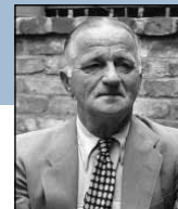
Carl A. Spaatz Chairman, 1950-51