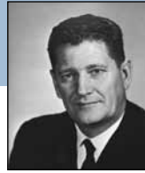
Joe Foss President, 1961-62 Chairman, 1962-63