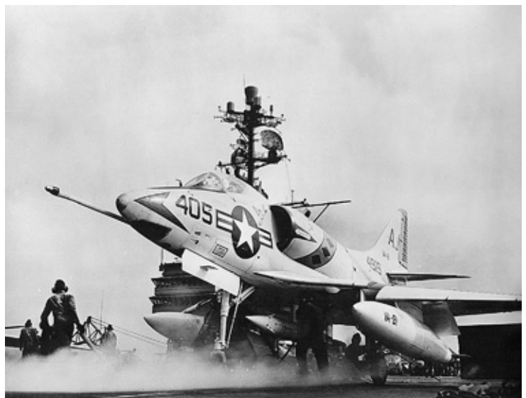
A Skyhawk powers up on a carrier deck.

Dropped first and last bombs of Vietnam War ★ suffered 380 aircraft losses (276 combat) and 47 POW losses in Vietnam ★ set 500 km closed-course speed record (695.163 mph) in 1955 ★ nicknamed Heinemann's Hot Rod after chief designer Ed Heinemann; also Scooter, Bantam Bomber, Tinker Toy, Mighty Mite, Camel, Skyhog, Vulture (Israel), Chickenhawk (Australia) ★ equipped with thermal cockpit shield for nuclear operations ★ carried special belly tanks designed to save airframe in a wheels-up landing ★ boasted roll rate of 720 degrees per second ★ saw combat with air forces of Kuwait, Israel, Argentina ★ used as stand-in for MiG-17 in dissimilar air combat training ★ featured in movie "Top Gun," 1986.