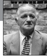
Carl A. Spaatz Chairman, 1950-51