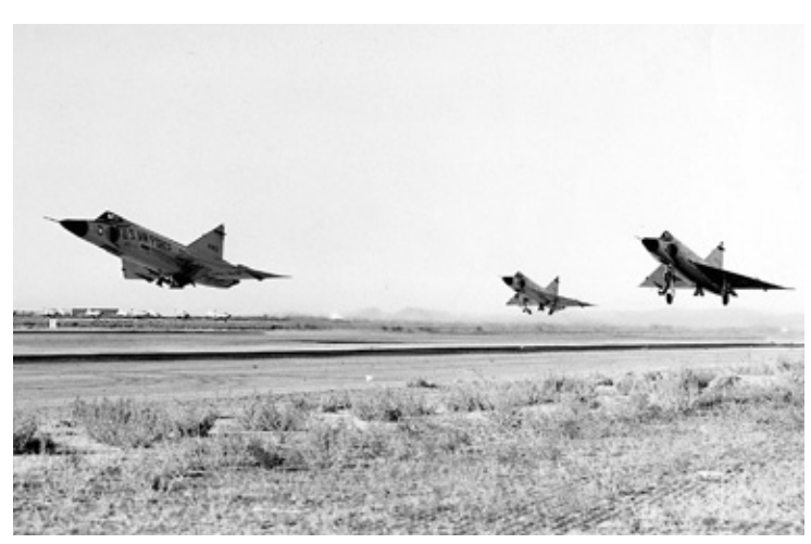
Three Delta Daggers head out.

Nicknamed "the Deuce" ★ designed without a gun (first for a USAF fighter) ★ became world's first operational supersonic delta-wing aircraft ★ used often in Vietnam War as a FAC aircraft ★ suffered combat losses (15) during SE Asian War, but only one air-to-air loss ★ flown by Turkey's air force in combat over Crete ★ converted after combat service to QF-102A piloted drones and PQM-102A unmanned drones ★ led to F-106 Delta Dart and some aspects of the B-58 Hustler.