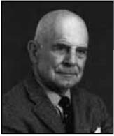
Jimmy Doolittle President, 1946-47 Chairman, 1947-49