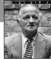
Carl A. Spaatz Chairman, 1950-51