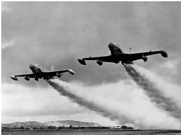
Shooting Stars in rocket-assisted takeoff.

Flown by the Acrojets, first USAF jet aerobatic team ★ made first overflight of Soviet Union May 10, 1949 ★ 277 F-80Cs shot down or otherwise lost in Korean War ★ operated by Navy as well as USAF ★ flown by air forces of Brazil, Chile, Colombia, Ecuador, Peru, Uruguay, Yugoslavia ★ served as basis for later F-94 interceptor and T-33 trainer ★ called (as prototype) Lulu Belle and Green Hornet .