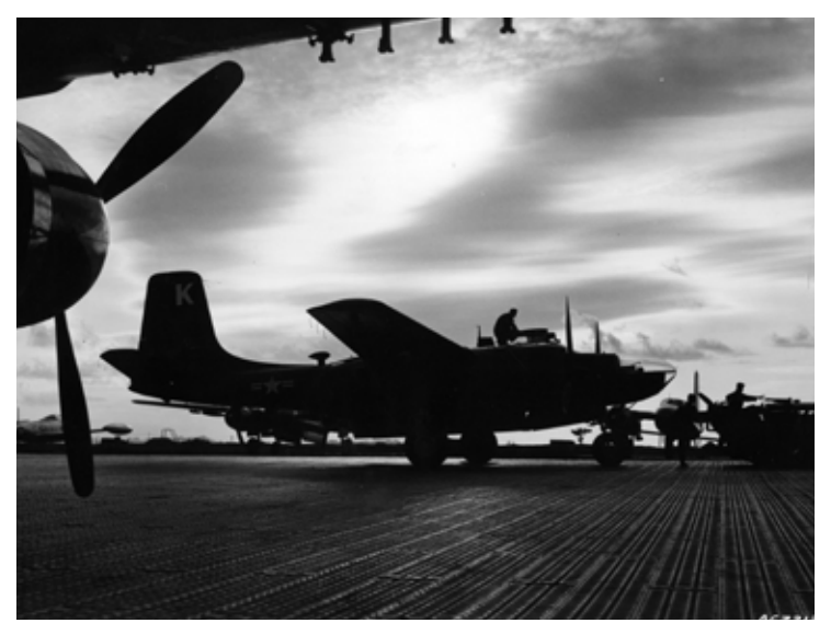
A World War II A-26C on the ramp.

Fastest piston-engine bomber of WWII \star redesignated B-26 (1948) and re-redesignated A-26A (1962) \star last airplane designated "attackbomber" \star flew first (June 28, 1950) and last (June 27, 1953) US bombing missions in Korea \star seen in 1989 Steven Spielberg film "Always" \star used by Cuban exiles in 1961 Bay of Pigs invasion \star flown by CIA-backed mercenaries in the Congo in early 1960s \star operated by 17 foreign air forces \star SAC RB-26 recce aircraft for two years.