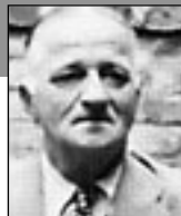
Carl A. Spaatz Chairman, 1950-51