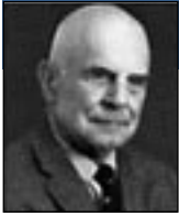
Jimmy Doolittle 1946-47