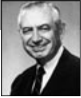
W. Randolph Lovelace II 1963-64