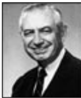
W. Randolph Lovelace II 1963-64