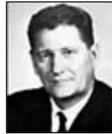
Joe Foss 1961-62