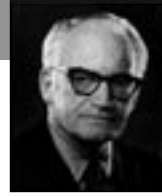
Barry M. Goldwater 1975-86