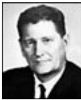
Joe Foss 1962-63