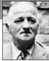
Carl A. Spaatz 1950-51