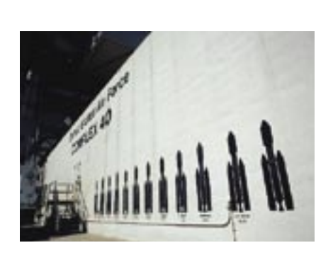
Above, top: Seconds after blastoff, the rocket and its payload roar upward, lighting the sky and trailing a plume of smoke. Above, a wall at pad 40A is decorated with "mission markings" for each successful launch from that site. Now, data for B30 can be added.