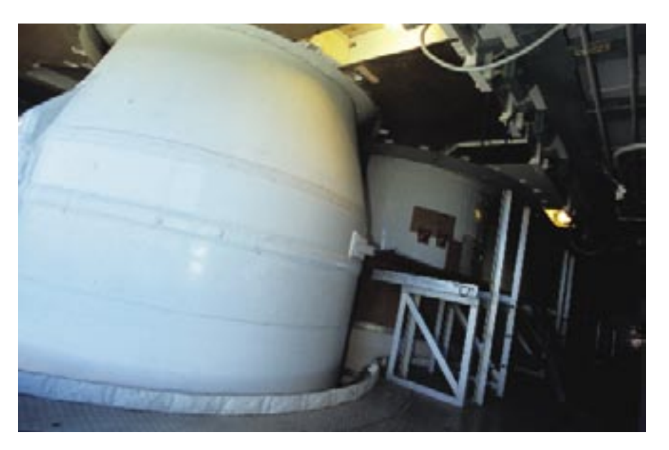
At left is the crucial joint where the Titan's solid rocket motors were mated to the main stages. The solid rocket motors fire first, lifting the rest of the launch vehicle.

Air Force and contractor personnel do their utmost to ensure success. The technicians monitor, check, and recheck the equipment to ensure everything is performing to exacting specifications.