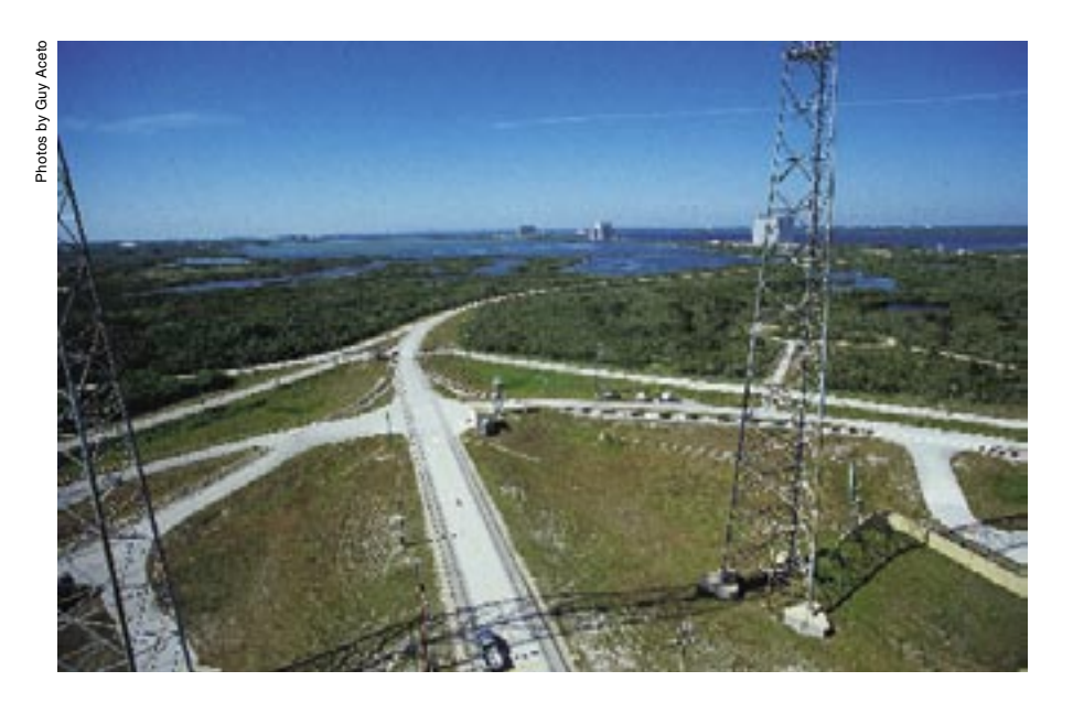
Rail lines (left and below) carry assembled rockets to their protective launch gantries. Each gantry is surrounded by four metal towers (below) that draw lightning strikes away from the assembled rocket. The photo at left was taken from the vantage of a gantry.