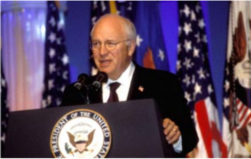
Vice President Dick Cheney, speaking at one of two convention symposia, delivered a ringing defense of the need to stay on the offensive to prevent new terror atrocities. (See "Toward a New Style of Warfare," p. 80.)