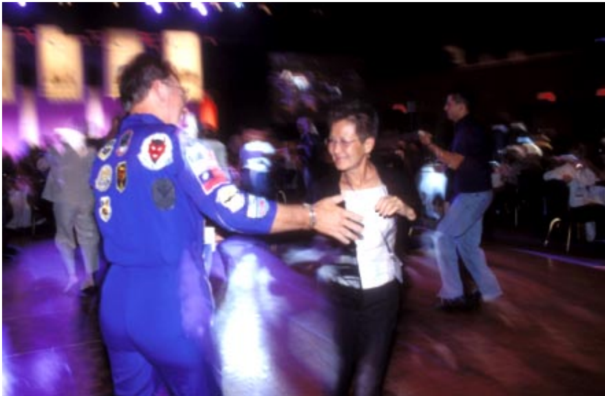
Conventioners hit the dance floor at AEF's festive Sept. 14 gala, billed as a "Squadron Reunion." Several individuals resurrected old "party suits" adorned with squadron patches.