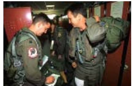
Above, 494th crews prepare for the day's flying. At left, a row of F-15Es.

The 494th is one of two F-15E units under Lakenheath's 48th Fighter Wing, known as the "Liberty Wing," a designation officially recognized in 1954. The other F-15E unit is the 492nd Fighter Squadron. A third 48th flying unit, the 493rd Fighter Squadron, flies the F-15C.