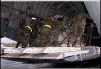
Shining Hope. Above, airmen with the 623d AMSS, Ramstein AB, load equipment and supplies into a C-17 for an April 14 flight to Albania. USAF mounted a major airlift of food, water, shelter, medicine, and other items. The C-17 at right is at Rinas Airport, in Tirana, Albania, the hub of the Allied humanitarian relief effort, Shining Hope.