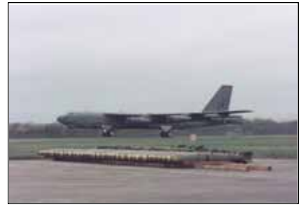
Long Haul? Bomber crews—at left, B-52H crews from the 2d Bomb Wing, Barksdale AFB, La., and the 5th BW, Minot AFB, N.D.—conduct a formation brief at RAF Fairford, before an early April cruise missile attack. Above, a BUFF takes off for an April 11 mission from Fairford. Airmen were warned that the war could go on for months.