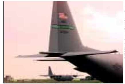
Load and Lift. At left, a crew chief with the 627th Air Mobility Support Squadron, RAF Mildenhall, directs a C-5B to a parking spot after an April 22 delivery of fuel trucks. Above, C-130s land at Gioia del Colle, Italy, to resupply forces there. USAF's airlifters provided a vital edge to NATO forces. So did various special-use aircraft such as the E-3 AWACS, E-8 Joint STARS, and RC-135 Rivet Joint.