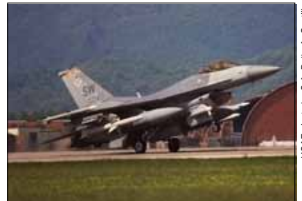
Workhorse. An F-16 from Shaw AFB, S.C., takes off from Aviano on April 28 for another sortie into the Balkan battlespace. The single-engine aircraft proved to be a workhorse of the war, used extensively not only by the US Air Force but also by the air arms of many European Allies.