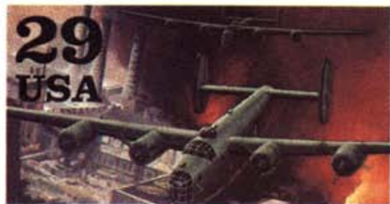
B-24s hit Ploesti refineries, August 1943

Between 1991 and 1995 the USPS offered a series of stamps to commemorate the 50th anniversary of World War II. Ten stamps were issued for each year of the war and were also used to surround a large map showing pivotal events of the war during that year. The 1943 map collection, issued in 1993, is shown above. One stamp (right) depicts B-24s from Operation Tidal Wave flying over the burning remains of oil refineries, destroyed in a raid on Ploesti, Romania.