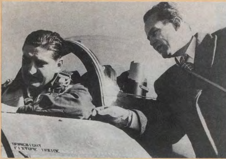
In Korea in December 1951, Col. Francis S. Gabreski briefs Robert S. Johnson, then immediate past president of AFA, on the F-86 Sabrejet. (Bob Johnson was Colonel Gabreski's wingman in the 61st Fighter Squadron in World War II and fourth-ranking ace of that war.) Colonel Gabreski is the top living American ace with a total of 34.5 aerial victories—twenty-eight in World War II and 6.5 in Korea. He was recalled to active duty during the Korean War and commanded the 51st Fighter-Interceptor Wing. Colonel Gabreski, USAF (Ret.), lives in Dix Hills, N. Y.