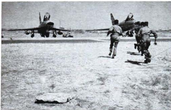
Pilots of TAC's 354th Tactical Fighter Wing of Myrtle Beach, S. C., race for their F-100 Supersabres. Since Lebanon crisis of 1958, TAC fighter units have supported US commitments overseas on rotation and played major roles in exercises in US under direction of Strike Command.

a global striking force to deter or fight limited war. The Composite Air Strike Force—a packaged tactical air force tailored for worldwide deployment—was developed in 1954 and proved in 1958 in Lebanon and Formosa. Thus, TAC had become a global force with emphasis on nuclear striking power.