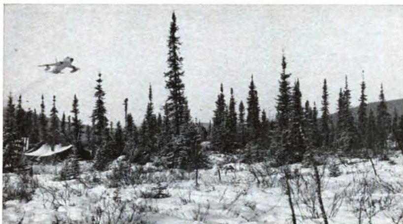
Republic F-105D Thunderchief roars over an advance ground forces position on pine-dotted Alaskan plain during Exercise Polar Siege last winter, conducted by US Strike Command to test joint Army-Air Force operations under extreme cold-weather conditions.