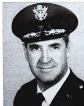
Gen. Walter C. Sweeney, Jr., a 1930 West Point graduate who won his wings in 1935, was named Commander of Tactical Air Command in 1961. A native of West Virginia, he took part in Pacific combat in World War II, later served as SAC Director of Plans and Commander of Fifteenth and Eighth Air Forces before his assignment to TAC.

Too much happened during FY '64 to point out any one single development as the outstanding event of the year. However, establishment in November of the Tactical Air Warfare Center (TAWC) was the focal point for all TAC activities. TAWC's establishment reflects implementation of a basic policy laid down by Gen. Walter C. Sweeney, Jr., when he assumed command of TAC in the fall of 1961. At that time, General Sweeney declared that the first order of TAC business was to increase the command's combat capabilities in quality and quantity in order to ensure maximum support for the Army.