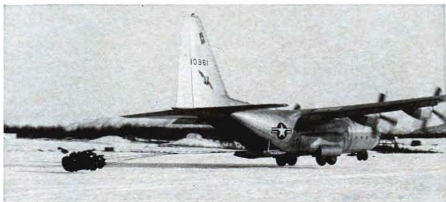
Veteran North American F-100 Supersabre, shown at left in low-level pass, has been TAC fighter mainstay for ten years. Above, Lockheed C-130 Hercules demonstrates low-level delivery technique in Exercise Polar Siege, in which cargo is extracted by parachute while plane flies at minimum speed over drop zone.

diately available for duty with Army forces. The majority are jump qualified, as well as being experienced fighter pilots with cross-training in recon and assault-airlift requirements.