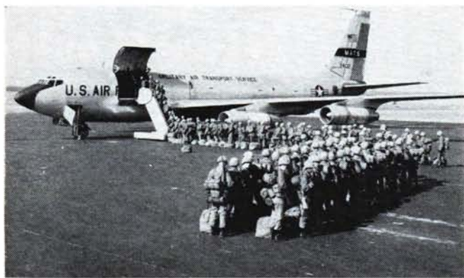
One of the Military Air Transport Service's significant efforts in past year was Exercise Delawar in which STRICOM troops were airlifted through unpredictable weather and over unfamiliar terrain from US to Iran. Above, 101st Airborne soldiers board MATS C-135 at Ft. Campbell, Ky., for Iran.

The two military airlift missions that paced MATS activities during the year were Big Lift, in which the command airlifted the personnel and much of the equipment of an entire armored division from the US to Europe in sixty-three hours and five minutes; and