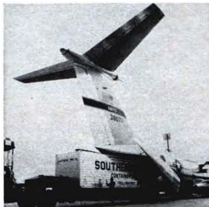
The C-141 can carry practically anything, as witness this demonstration at Lockheed-Georgia facility, in which forty-foot-long trailer van is moved directly aboard a StarLifter, using straight-in rear loading.

One of the busiest MATS units in the USAF space program was the Air Photographic and Charting Service (APCS), manager of the Air Force portion of the Project Anna geodetic-satellite program. Management of Anna made APCS the first unit outside Air Force Systems Command to have operational control of an orbiting satellite. Early last year APCS began a worldwide gravity-research program which two years from now will provide information vital to space vehicle reentry and atmospheric operations. Meanwhile, APCS cameramen provided invaluable engineering photography on Air Force missile tests and site locations. APCS photographers provided combat cov- (Continued on following page)