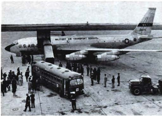
Aeromedical evacuation has been reorganized, with provision for centralized control and maintenance at Scott AFB, Ill., headquarters of Military Air Transport Service, under new 1405th Aeromedical Transport Wing. MATS's 1405th directs both domestic and overseas medical evac missions.

erage in Vietnam and photographed TAC weapons-effectiveness tests, while the command continued important photo-mapping and aerial-survey projects to provide accurate charts of Ethiopia and Brazil.