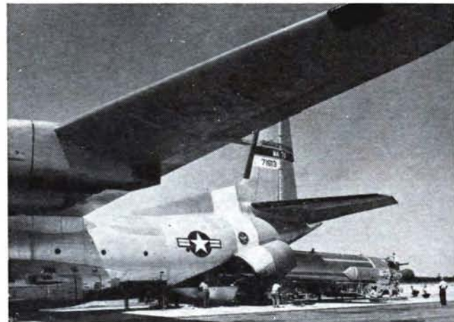
Aiding space program in an airlift way, MATS C-133 transport arrives at Cape Kennedy carrying the Atlas which later boosted Mercury astronaut Maj. L. Gordon Cooper, Jr., into orbit. Space vehicle was airlifted to Cape from the San Diego, Calif., facility of General Dynamics/Astronautics.

DoD is expected to make a decision soon on development of the CX-HLS. Meanwhile MATS is continuing to stress development toward perfection of the nation's mobility preparedness to meet any situation in any area of the world with the right combination of forces at the right time.—END