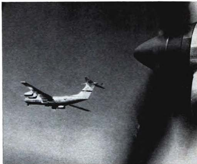
Jet mobility for the jet age: In-flight photo of MATS's new Lockheed C-141 StarLifter, the current ultimate in rapid air transport of men and equipment to trouble spots around the world. Huge plane will join MATS fleet in June 1965.

The technical services, although integral to MATS, also serve other elements of the defense establishment. Air Rescue Service, in addition to providing all facilities available for assistance in any rescue situation,