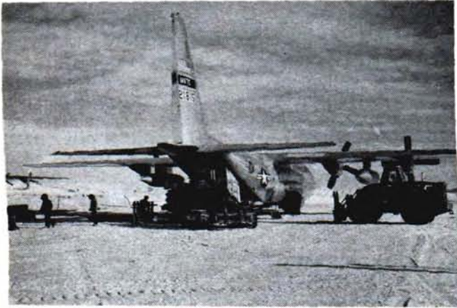
MATS C-130 Hercules transports deliver supplies to McMurdo Sound, Antarctica, chief US facility in the frozen south. Hercules service brings faster, more efficient airlift for Navy's Operation Deep Freeze Task Force which, with National Science Foundation, runs US Antarctic ice exploration.

training—preparation for being able to deliver when, where, and in the precise manner dictated by any emergency. This training included airdrop of more than 70,000 Army paratroopers and 700 tons of cargo.