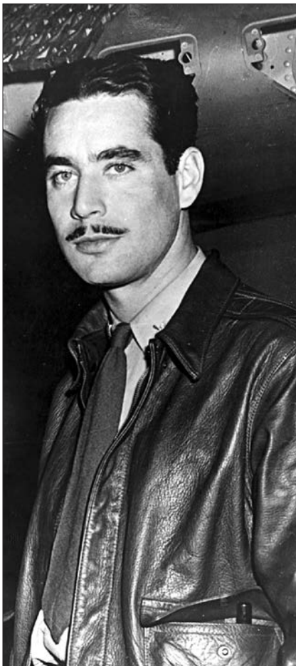
Boyd Wagner is the first AAF ace of World War II.

Thus, the standards for World War II and Korea were more restrictive than those for World War I and Vietnam.