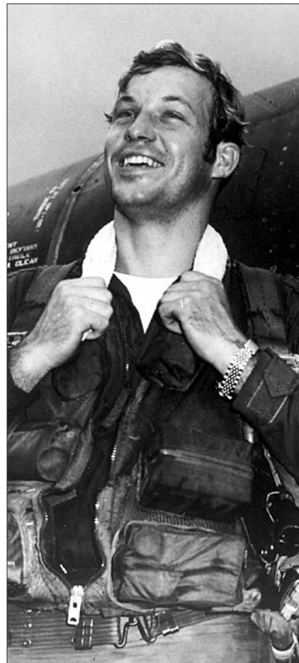
Richard Ritchie is the first USAF ace of the Vietnam War.