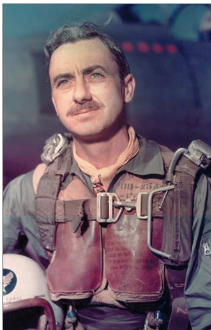
Vermont Garrison (10)