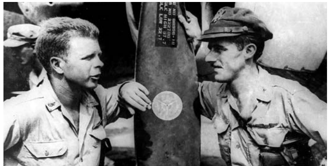
The top two scoring aces of WW II, Richard Bong (left) (40) and Thomas McGuire Jr. (38).