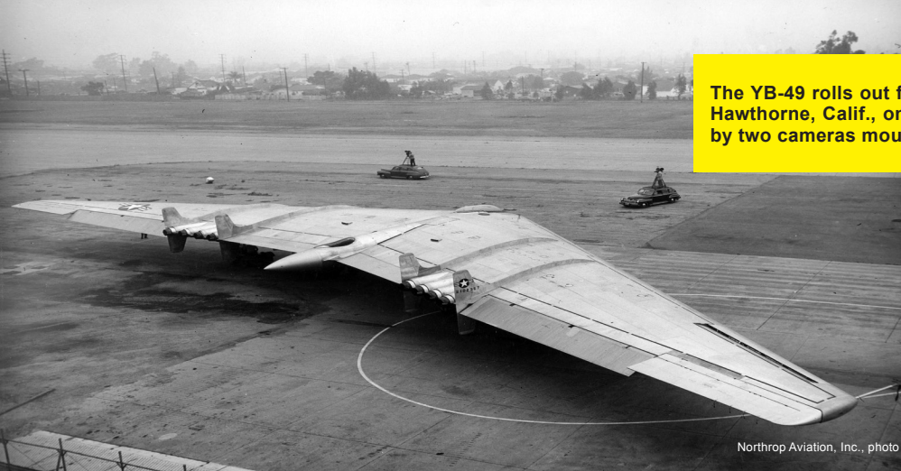
The YB-49 rolls out from its hangar at Northrop Aircraft, Inc., in Hawthorne, Calif., on Sept. 29, 1947. The rollout is being filmed by two cameras mounted on the roofs of cars.