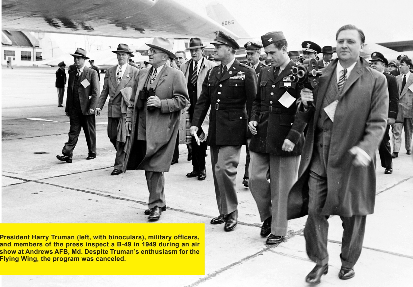
President Harry Truman (left, with binoculars), military officers, and members of the press inspect a B-49 in 1949 during an air show at Andrews AFB, Md. Despite Truman's enthusiasm for the Flying Wing, the program was canceled.