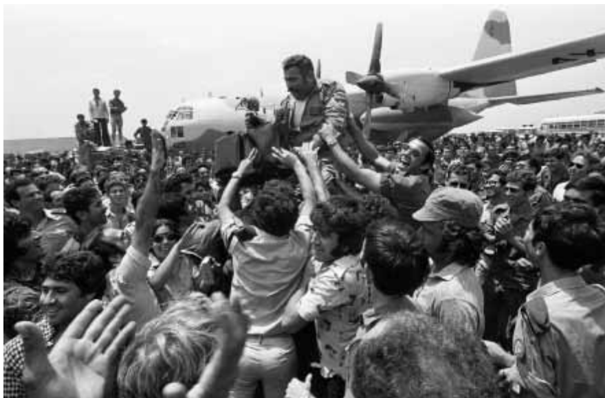
A jubilant crowd lifts an unidentified member of the rescue team into the air during the celebrations at the Ben Gurion Airport in Tel Aviv.