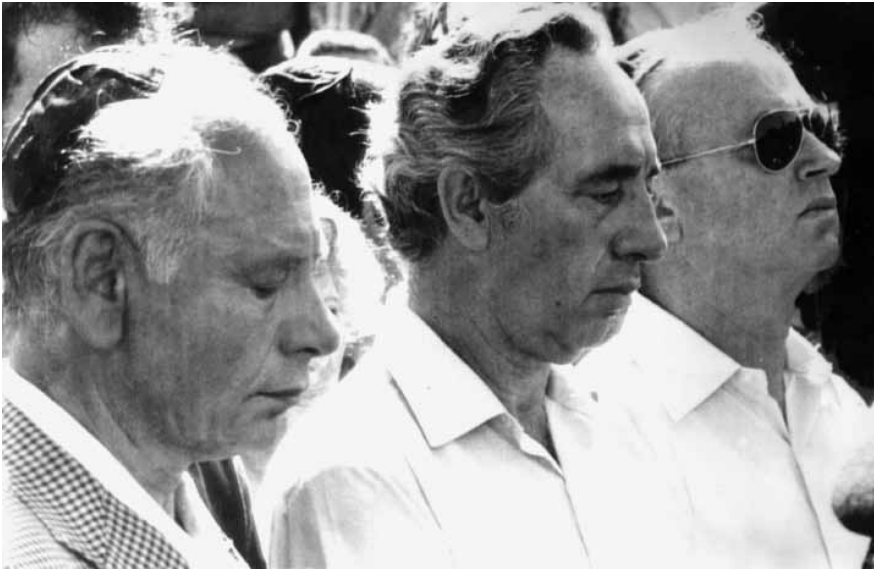
L-r: Ben Zion Netanyahu, Yoni's father, Defense Minister Shimon Peres, and Prime Minister Yitzhak Rabin, at Yoni Netanyahu's funeral ceremony in Jerusalem in 1976.