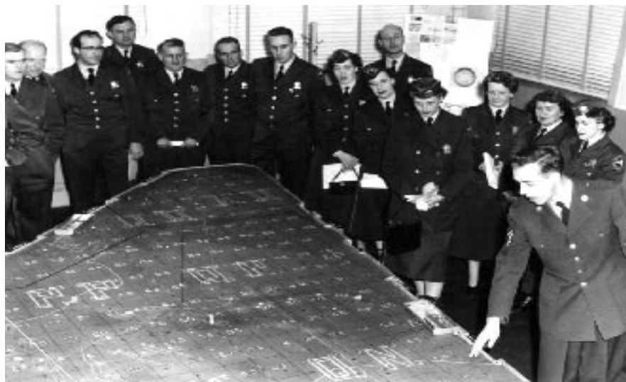
In the early days, GOC used horizontal plotting boards, such as the one shown here at the Syracuse filter center. Models were moved manually around the board to indicate the position of an aircraft.

These active defense measures were in contrast to the passive measures such as dispersion of aircraft, camouflage, blackouts, and other routine precautions.