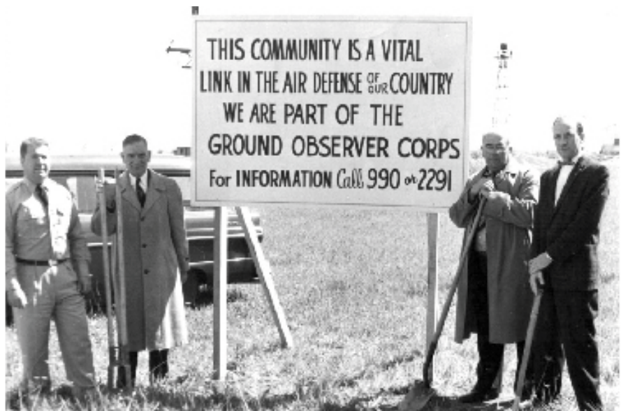
Pictured is a groundbreaking ceremony for a GOC observation post in New York state. GOC posts were constructed on top of existing buildings or on hilltops—any place with a clear, unobstructed view of the sky.