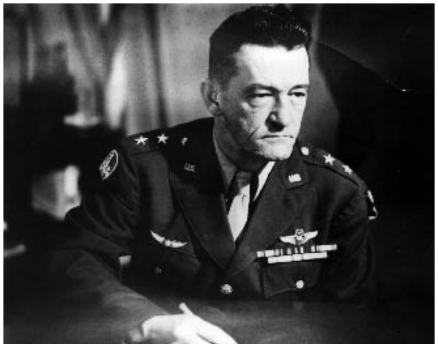
Claire Chennault is shown here as a major general. For his time with the Flying Tigers, he had no official rank and was usually called “colonel.”

The Japanese held eastern China, including the coastline. Without access to the Chinese ports, Chiang Kai-shek relied on the Burma Road as his principal lifeline. Munitions and war materiel went north from Rangoon to the railhead at Lashio, where the Burma Road began. Built by the Chinese with hand labor, the Burma Road crossed the