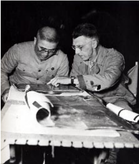
US Army Lt. Gen. Joseph Stilwell (r), shown here with Chinese Army Gen. Liao Yao-Hsiang, was in 1942 named commander of US forces in the China-Burma-India Theater. "Vinegar Joe" was an infantry officer with a strong prejudice against airpower. He immediately set about the task of taking over Chennault's Flying Tigers.