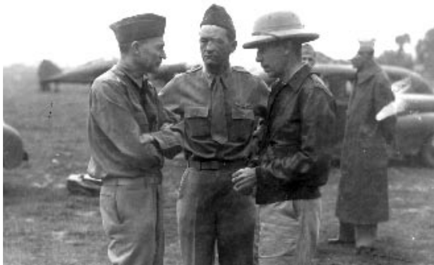
Chennault (c) confers in Kunming with Col. Robert Scott Jr. (l), later to become author of God Is My Co-Pilot , and Brig. Gen. Clayton Bissell. Chennault had a low opinion of Bissell, whom Stilwell picked as his air deputy.

Dissolution of the AVG was set for July 4, 1942, but the US Army was not ready. "Fifty-five AVG pilots and ground crew men who were unwilling to see the air defense of China collapse completely when the Army was unable to provide either planes or personnel by July 4 ... volunteered to remain in combat for two extra weeks," Chennault