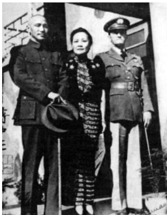
Pictured (l-r) are Generalissimo Chiang Kai-shek, Madame Chiang, and Claire Chennault. Madame Chiang, a shrewd political operator, was instrumental in bringing Chennault to China.

(Many stories about the AVG tell of fights with the Japanese Zero. In actuality, the Flying Tigers never faced the Mitsubishi A6M Zero. By December 1941, it had been withdrawn from China