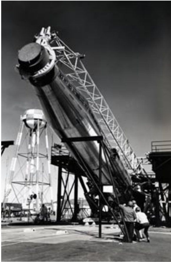
At left, a shiny Atlas is raised into firing position at the Convair factory in San Diego in 1959. Pictured below is the first operational Atlas launch facility at F.E. Warren AFB, Wyo., circa 1960. The missiles were kept horizontal in such “cof-fins” until crews received an order to prepare the ICBM for firing. It took 15 minutes to set up the kerosene- and liquid oxygen-fueled missile and get it ready for launch.

and in 1955—but the Army persisted in the argument that any missile launched from the ground should belong to the ground forces.