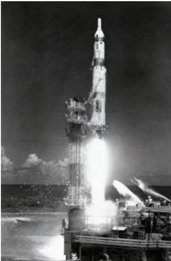
A developmental Titan, left, leaves a test pad near Cape Canaveral, Fla., in 1960. The missile went operational in 1962. Below, a Titan complex under construction. Everything visible would eventually be buried, indicating the depth of the complex.