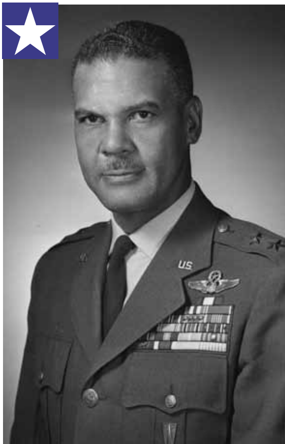
Davis, above left in his P-51B, led many World War II missions, including a memorable 1,600-mile bomber escort to Berlin on March 24, 1945. In 1953 he became the first African-American Air Force officer to achieve general's rank.

Davis was serving at Tuskegee in 1940 during the second reelection